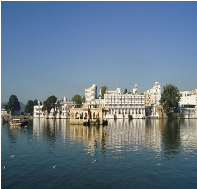
Lake Pichola, Udaipur