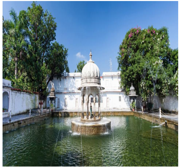
Sahelion Ki Bari, Udaipur