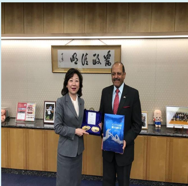
Ambassador H.E. Sujan R. Chinoy with H.E Seiko Noda, Minister for Internal Affairs & Communications, Minister in Charge of Women's Empowerment