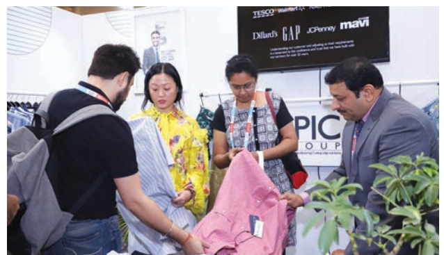
Some serious price negotiations at Epic Group's booth