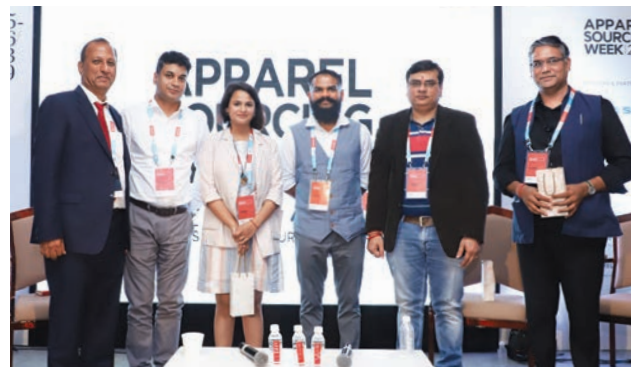
At one of the Panel Discussions themed 'Winning at E-commerce', experts aptly dealt with all the pain points of e-commerce