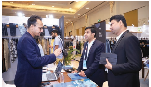
Well Group giving a company overview to the visitors at the booth