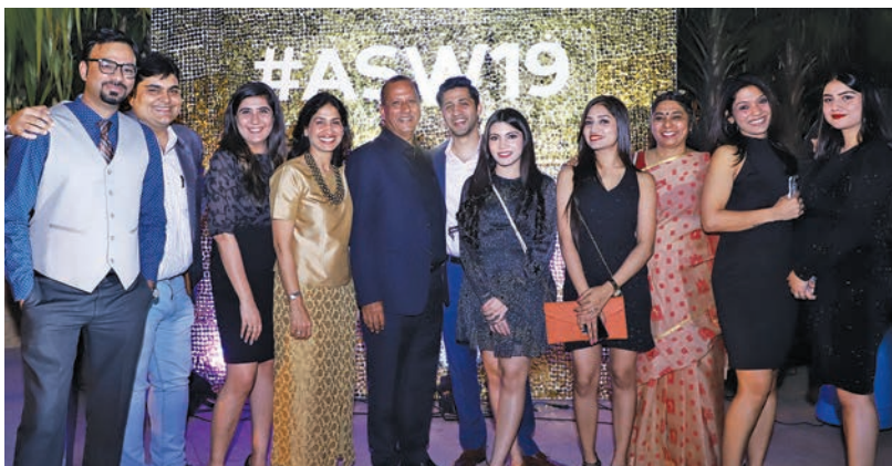
Networking team of ASW at the invite only dinner in the evening of Day-1