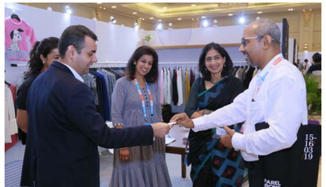
Anzir Apparels had a busy booth at ASW 2019