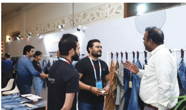
Pacific Jeans connecting with the denim retailers in India for future business