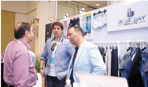
Blue Bay team discussing the variety of products that they cater to with a prospective customer