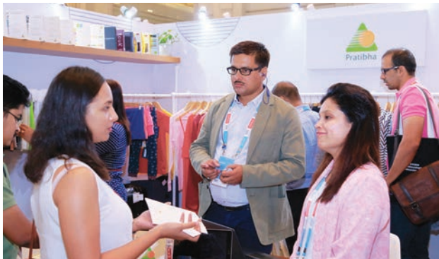
Pratibha Syntex proud to share their path to sustainability