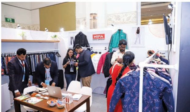
Outerwear is Nipa Group's core strength and it attracted quiet a few Indian retailers at the event

"Denims is a risky game when it comes to sustainability. Hence, I am visiting Apparel Sourcing Week in order to interact with denim vendors who come with the promise of sustainable and ethical operational practices - with the core agenda being bottomwear."