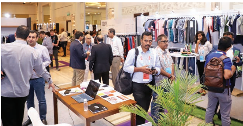
Just after inauguration of ASW '19, visitors were seen in the exhibitors' area and the number gradually increased