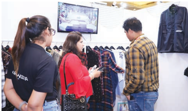
Green Smart Shirts had two busy days at the event with some successful order conversions

"A great show that gave me an opportunity to meet new clients and entertain my old ones. I met teams from Bestseller, Celio and many more. The show gave equal emphasis on educating the industry through many well-attended panel discussions, workshops and open house forums by industry experts."